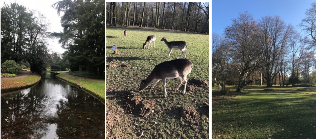
Gardens in Düsseldorf

Living in Düsseldorf is quite pleased and there are many events for everyone. A lot of people who come from different part of the world live in Düsseldorf, so I can say that Düsseldorf is an international city. You can make new friends from different parts of the world. Düsseldorf is not a crowded city but there is enough place to fun and shop. Also, the gardens of Düsseldorf are good for relaxing and spending leisure times.