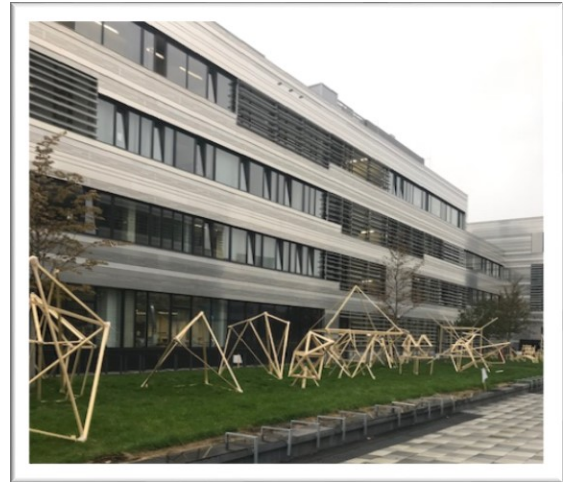
Applied Science University Düsseldorf