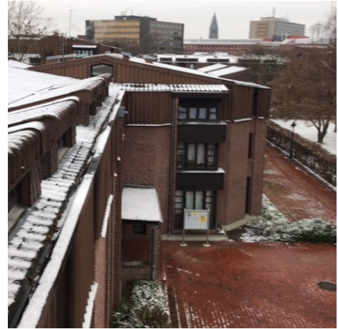
Studentenwerk dorm in Brinckmannstrasse

I think the most challenging thing in Düsseldorf is to find accommodation. There is very rarely apartment in the city center and its prices is quite high. Therefore, many people, who study or work in Düsseldorf, try to find cheap accommodation in the cities near Düsseldorf such as Duisburg. There are dorms for students supplied by Studentenwerk especially nearby the Heinrich Heine Universität. On the other hand, finding a room in these dorms is also quite hard due to many students are looking for room these dorms.